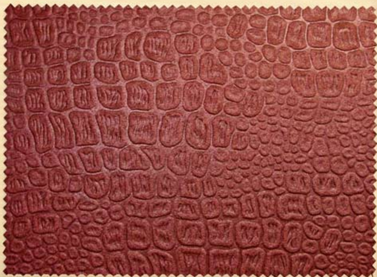
DIS. 021 "COCCODRILLO"