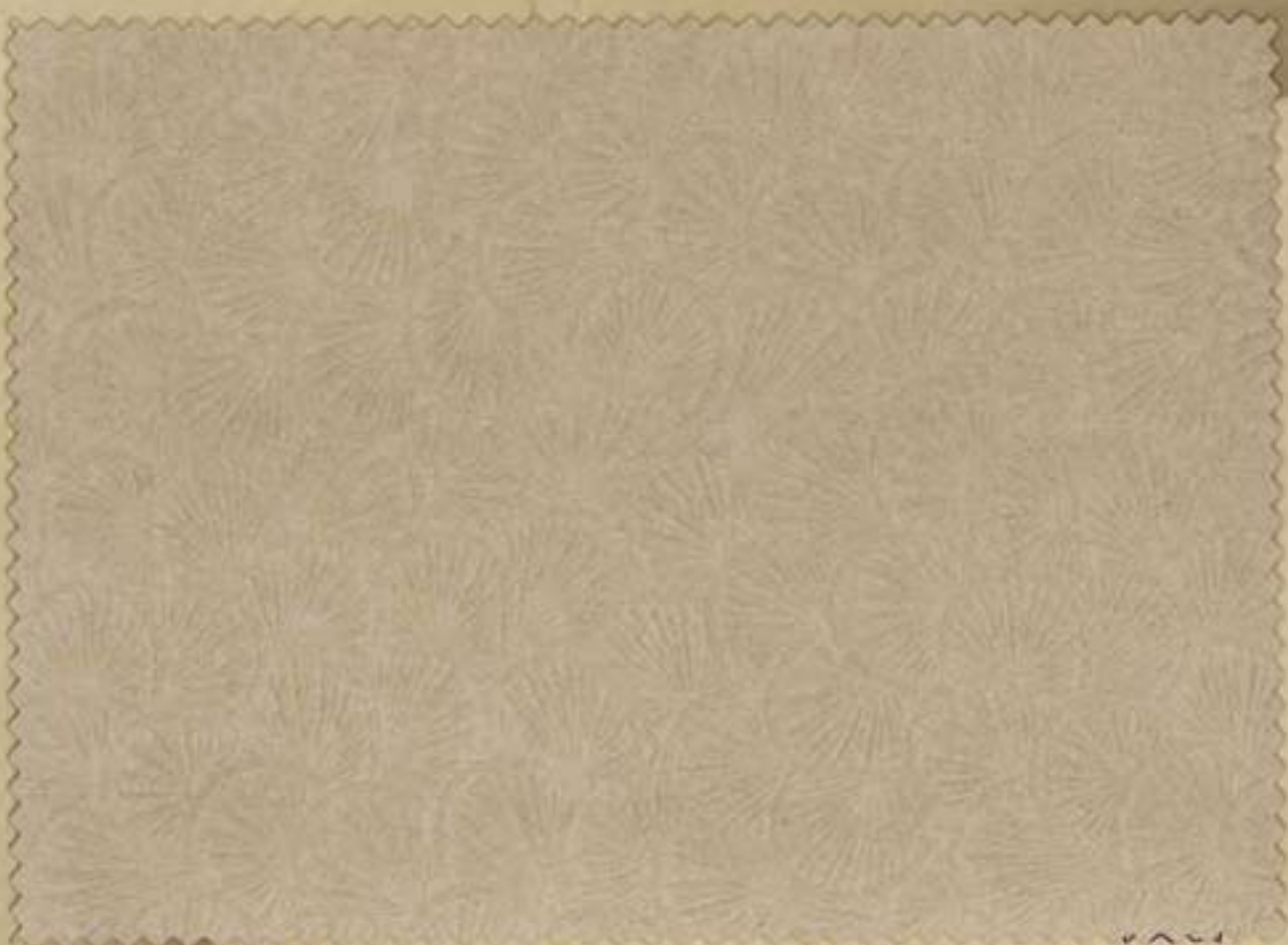
DIS. 180 "CONCHIGLIE"