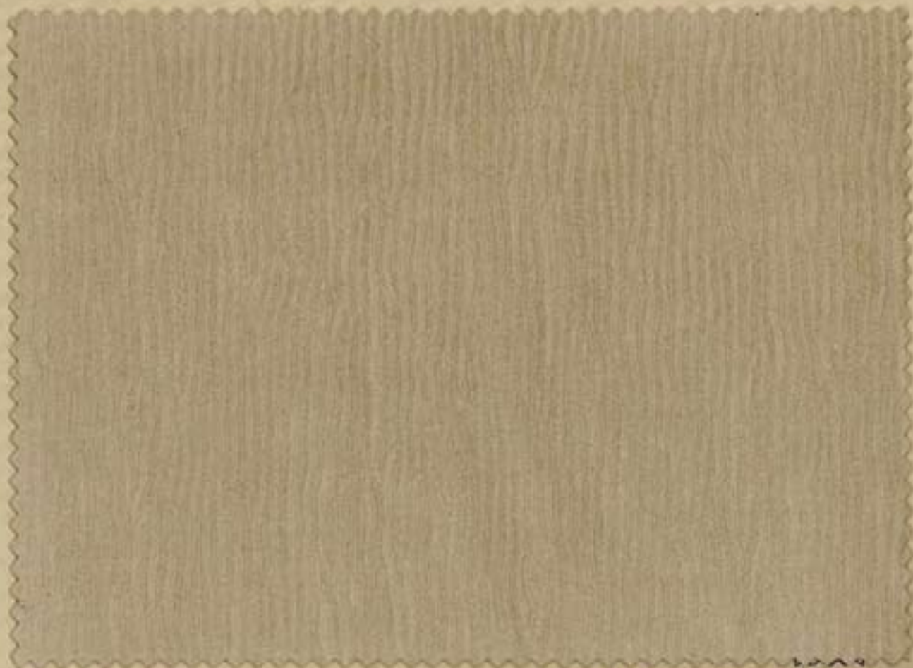
DIS. 031 "SABBIA"