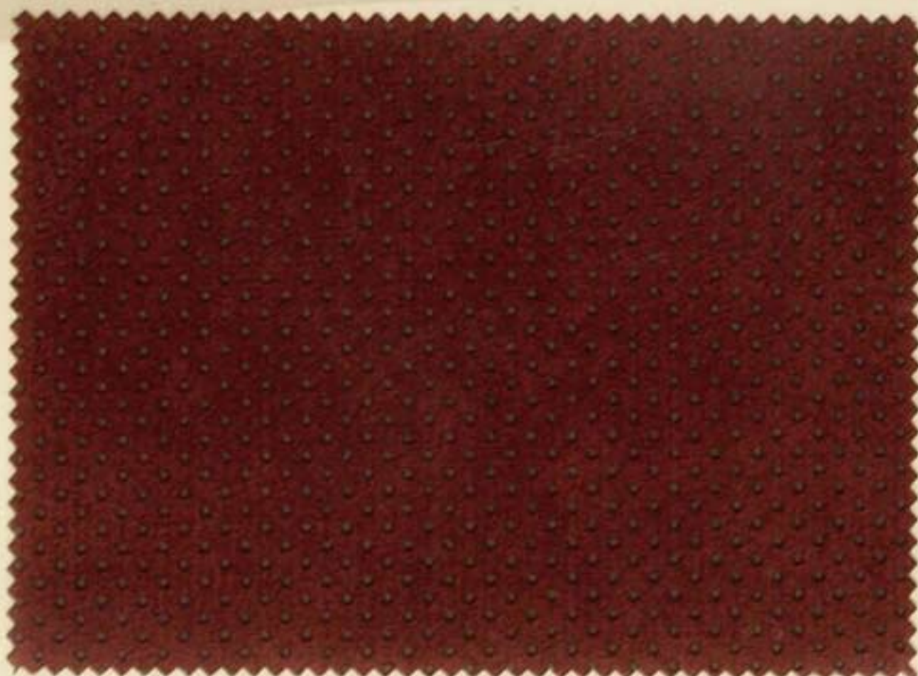
DIS. 078 "DOTS"